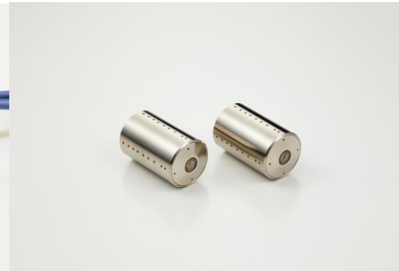
High NA UV Objective lens