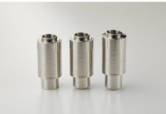
Long working distance immersion objective