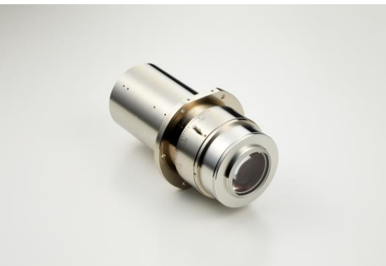
Ultra-long working distance immersion objective